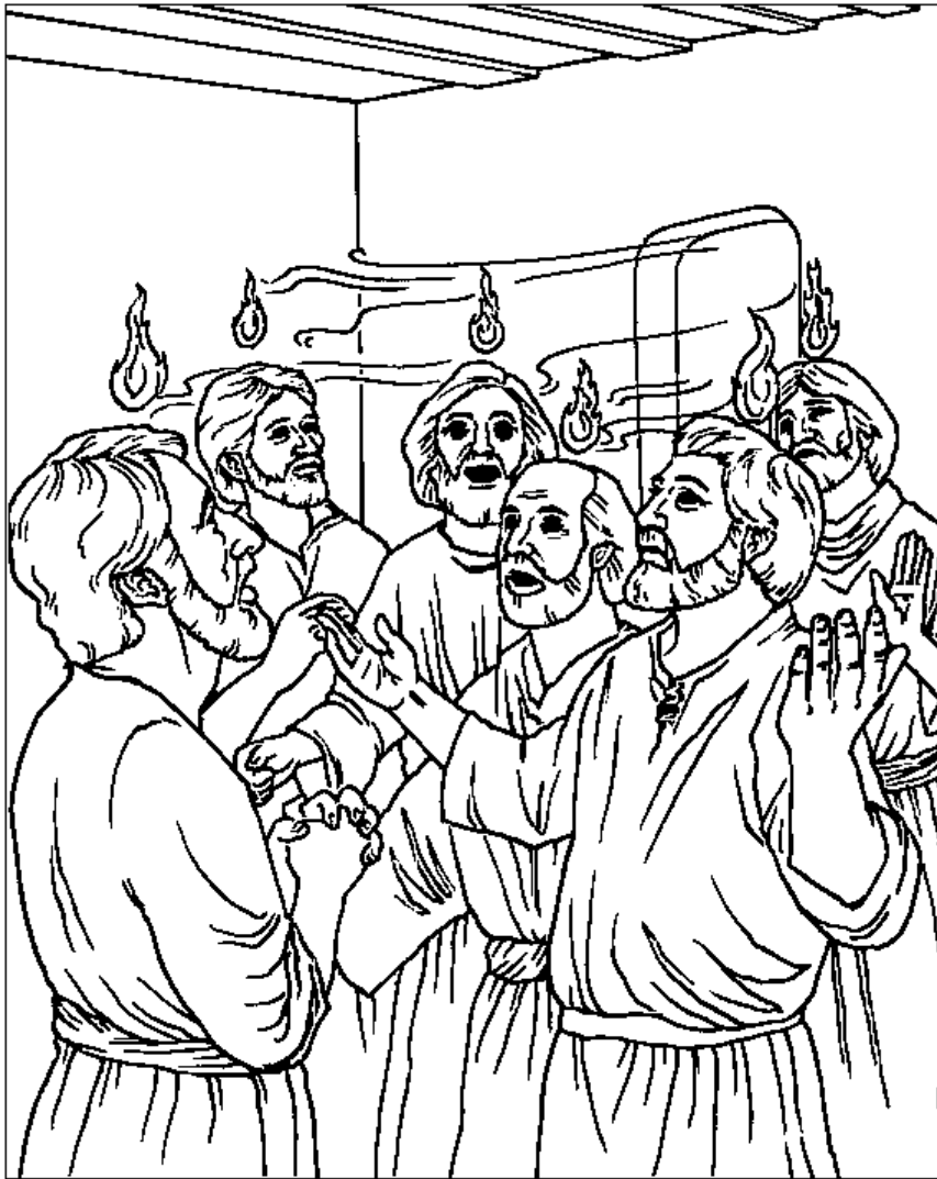
The Day of Pentecost Acts 2