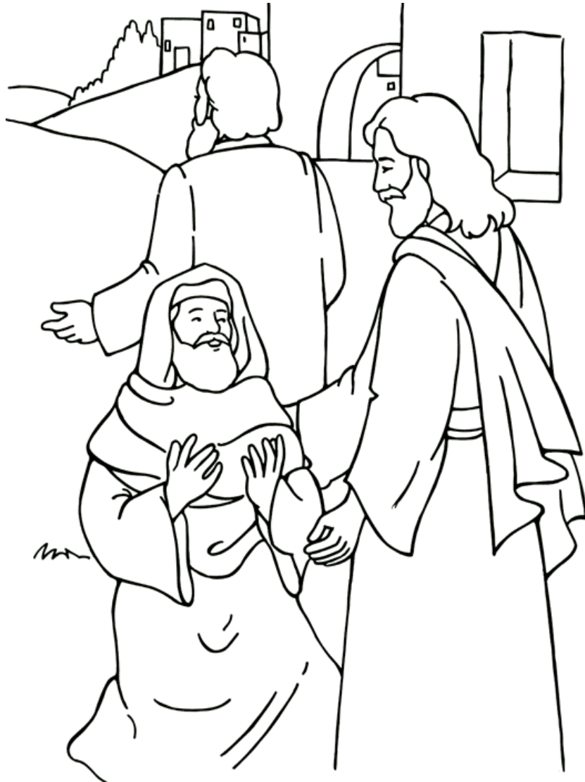
The Ten Lepers Luke 17:11-19