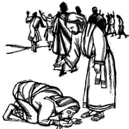
Jesus Heals 10 Lepers

Copyright © Sermons4Kids, Inc. May be reproduced for Ministry Use