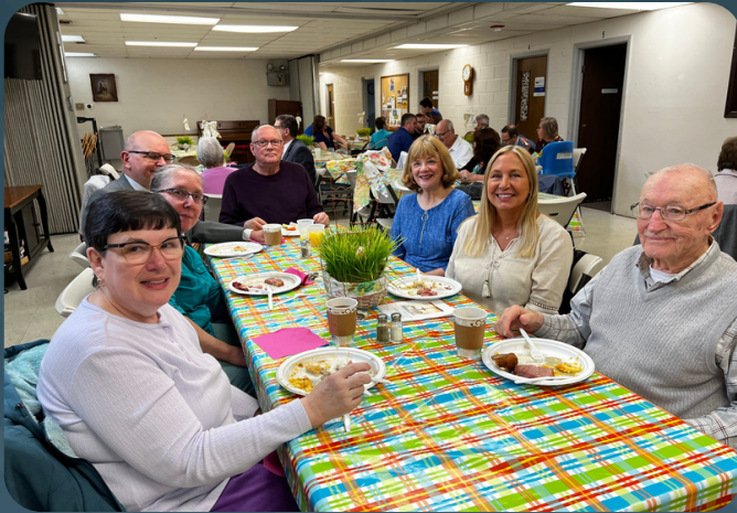
We had so much fun during Lent and on Easter! So many kids enjoyed the egg hunt!