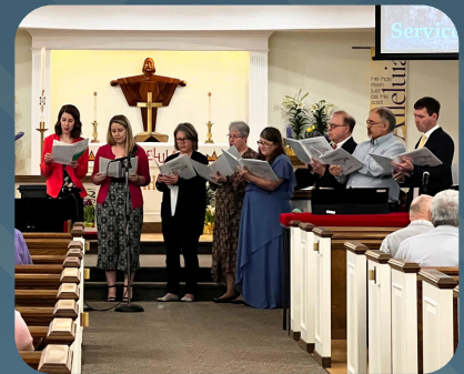
Thanks to everyone who used their talents to enhance our lenten & Holy Week services and fellowship time!