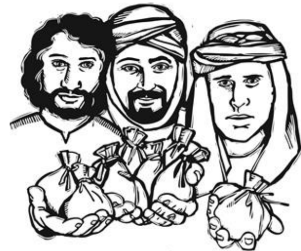
The Parable of the Talents