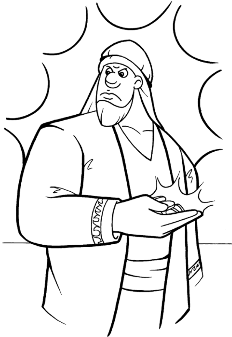
The Parable of the Talents Matthew 25:14-30